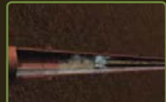
After a few minutes, retrieve the hose while jetting to remove and dissolve any remaining grease leaving the pipe and your hose squeaky clean.