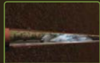
Grease Release is injected into the jetting stream to penetrate blockages, dissolving grease and leaving a trail of foam that penetrates and dissolves grease.

Using any jetter, scientifically formulated Grease Release blasts out grease all the way down to and into the pores where it clings. Grease Release then coats the pipe surfaces with a grease-repelling barrier that slows future build-ups and makes future cleaning easier and less frequent.