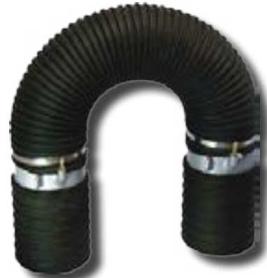
2 - 250-8's with 6" Flexible Bypass Hose