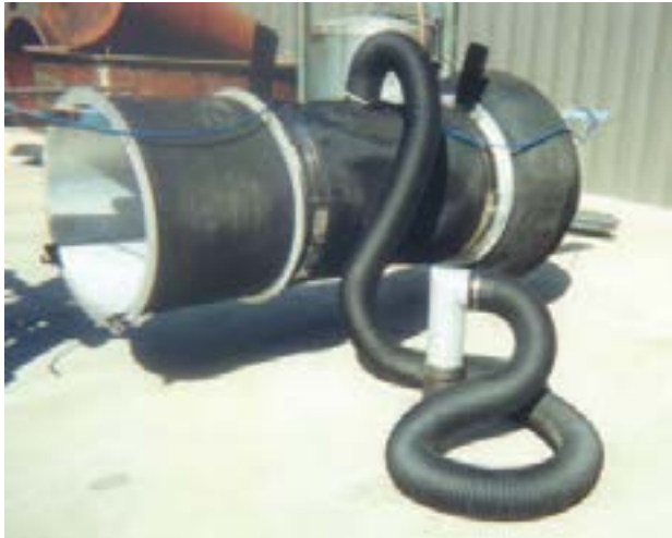
2 - 250-48 with 42" bypass picking up an 8" drop inlet with a 250-8 and a custom 90° elbow