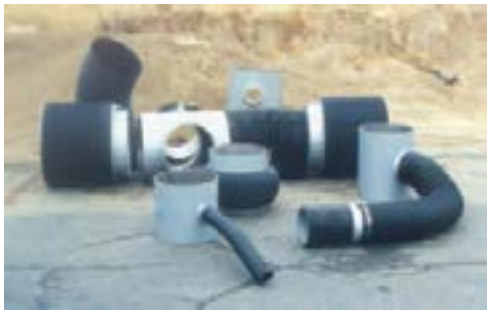
Custom 250 Series High-Flow setup with 8", 12", 18", & 24" bypass. Used in Santa Barbara, California to contain flow while 12 manholes were built. No pumping around was required!