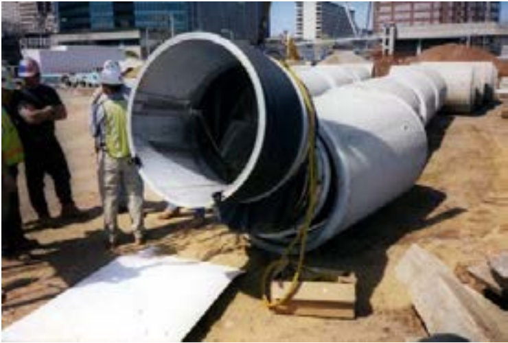
250-48 with a 42" bypass at a 22° angle